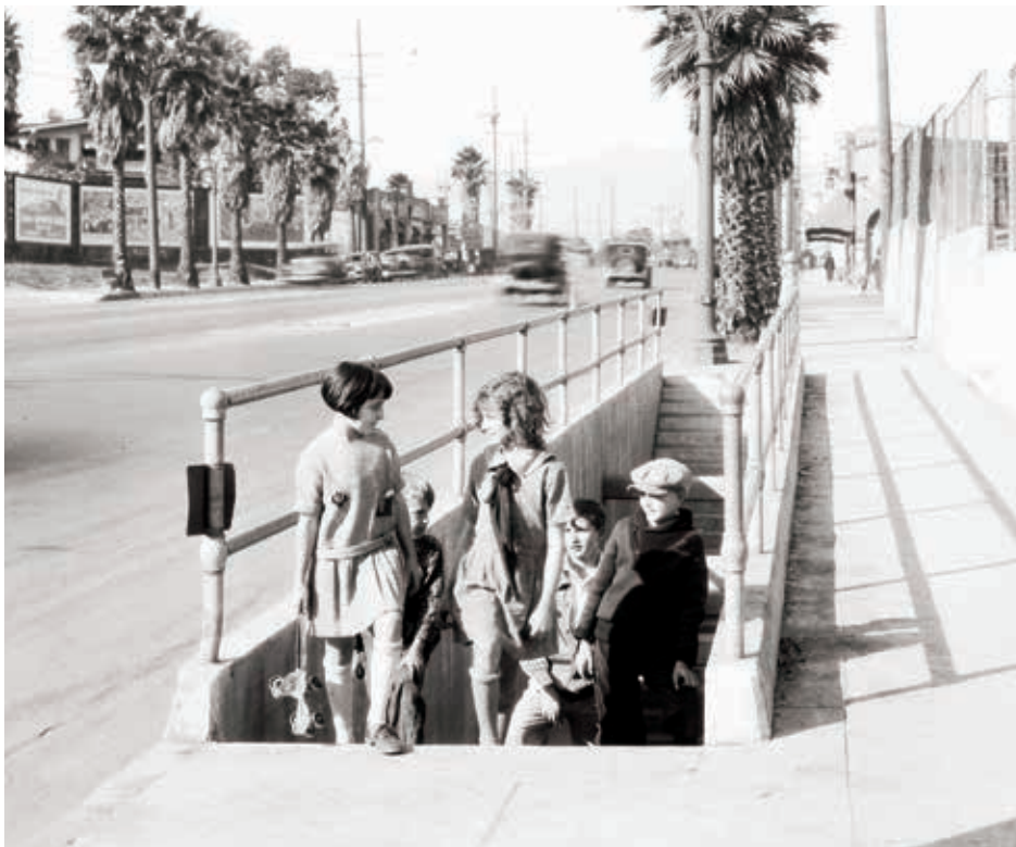
Micheltorena School Tunnel under Sunset (1927)