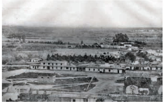
Earliest known close-up photograph of the Los Angeles Plaza. Square main brick reservoir in the middle of the Plaza was the terminus of the town's historic lifeline: the Zanja Madre ('Mother Ditch'). The reservoir was built in 1858 by the LA Water Works Company. (ca. 1858)

In addition to the museum section, our website ( http://waterandpower.org/museum/museum.html ) offers a quarterly newsletter that includes articles related