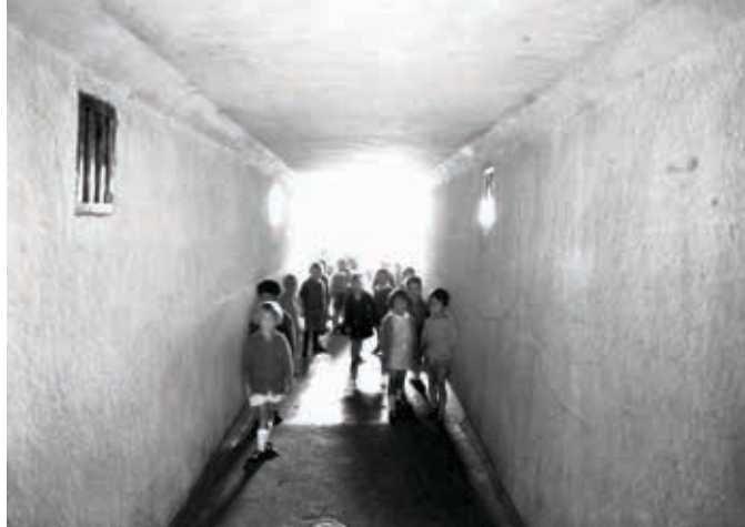
Top: Pedestrian Tunnel at Santa Barbara and Western Middle: Normandie Avenue School, circa 1920s

The LA County Traffic Committee solicited opinions, in 1940, from various government agencies on the advisability of utilizing aerial pedestrian bridges in lieu of tunnels