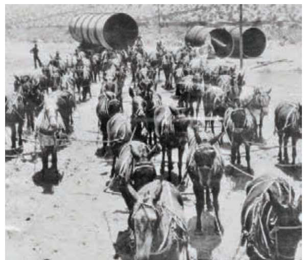
Transportation was largely by mule power when the Los Angeles Aqueduct was under construction. This photo shows a 52-mule team hauling sections of aqueduct pipe. (1912)