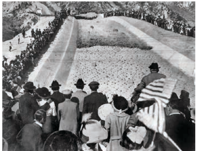
Wm. Mulholland (wearing his signature hat) leads the crowd as they watch the water gates open and the Los Angeles Aqueduct water starts to flow down the cascades into the San Fernando Valley. (Nov. 5, 1913)

The Man Who Built Los Angeles: see page 4