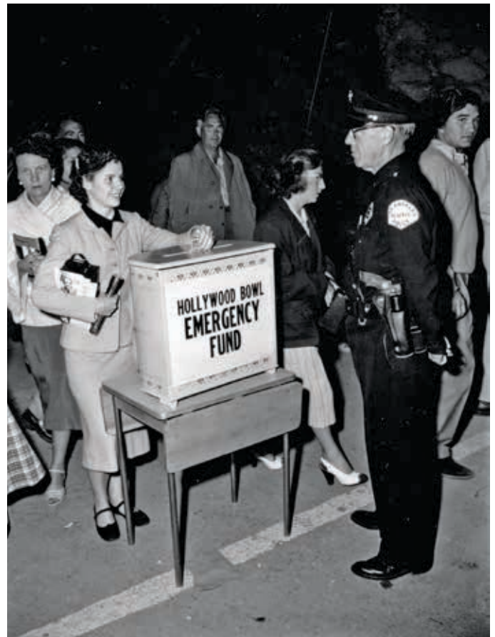
Hollywood Bowl Campaign (August 1951)

Speaking before the National Association of Manufacturers in New York on December 3, 1965, a year after her name was given to the Dorothy Chandler Pavilion, Dorothy Chandler said that anyone hoping to raise money for such ventures should make the ante "startlingly high. Many individual Music Center donors gave $25,000 and beyond," she said, "amounts previously unheard of in Southern California. It was," she said of the complex "a symbol of salesmanship." ★