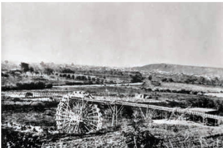
Los Angeles' second water wheel, built during Civil War days. The wheel was built to raise water from the Los Angeles River to the old Sainsevain Reservoir. (1863)