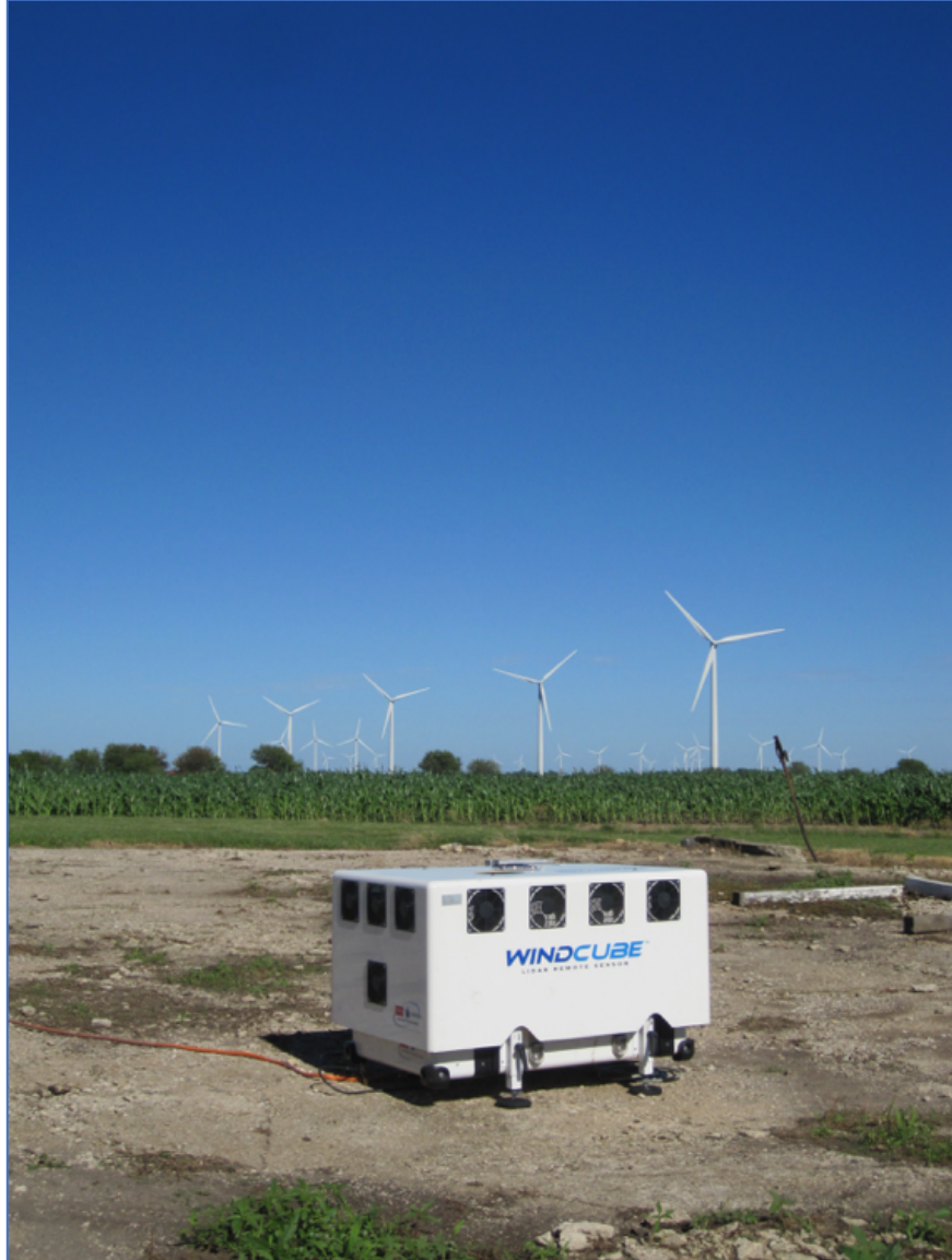
Figure S3: WC-3 looking to SE.