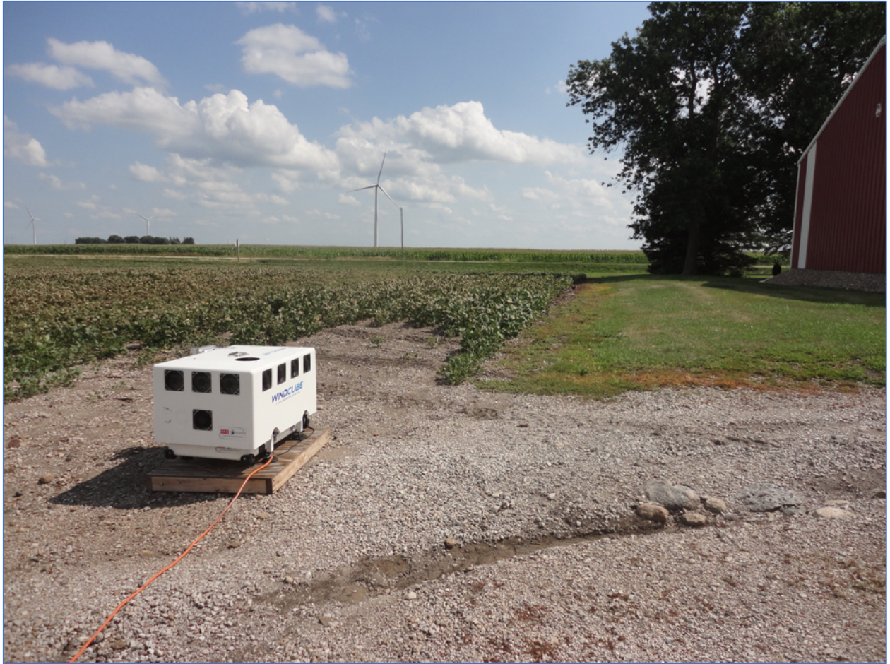
Figure S4: WC-2 looking to SE.