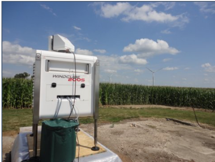
Figure S1: scanning lidar co-located with WC-3, looking to the southwest (photo courtesy Paul Quelet).

In order to assist the understanding of the setup of the field campaign, the description of the surroundings and possibly the interpretation of the results, we provide a few pictures of the site of the campaign and of some of the instrument deployed.