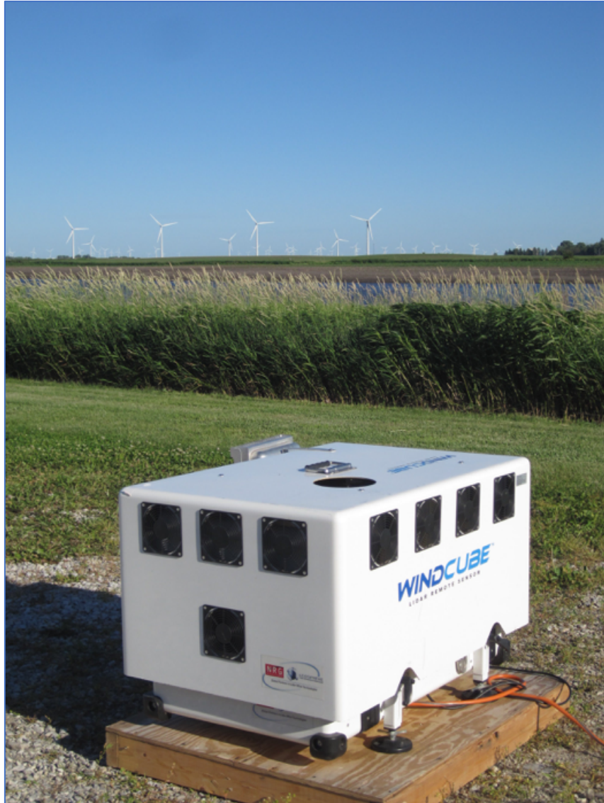
Figure S2: WC-1, looking towards SE.