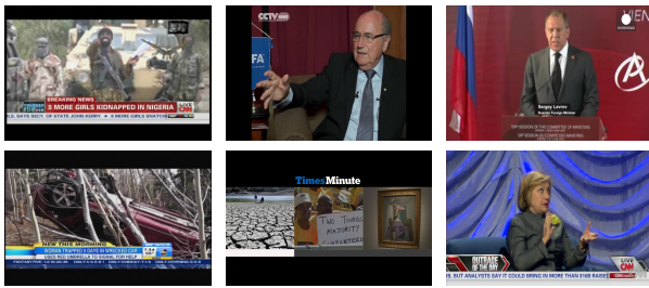
Figure 2: Examples of trending images detected on May 6, 2014.

in the system. This way, our system always indexes news programs from the most recent 10 days.