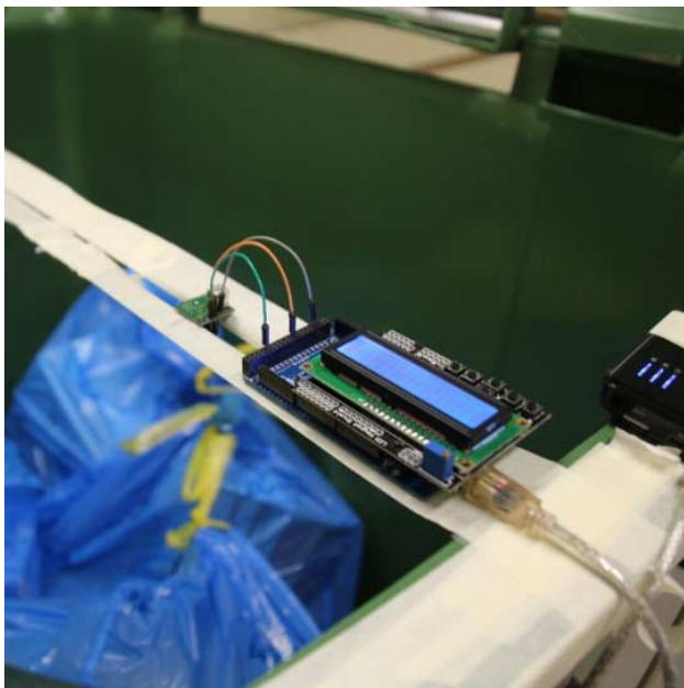
Figure 3. Experimental setup with sensors and an Arduino board for control

The Dynacargo operation does not assume availability of a fixed network infrastructure that reaches all the installed bins. At an urban scale of operation, this is a quite realistic assumption, since thousands of sensors are sparsely deployed in a complex city and suburban terrain.