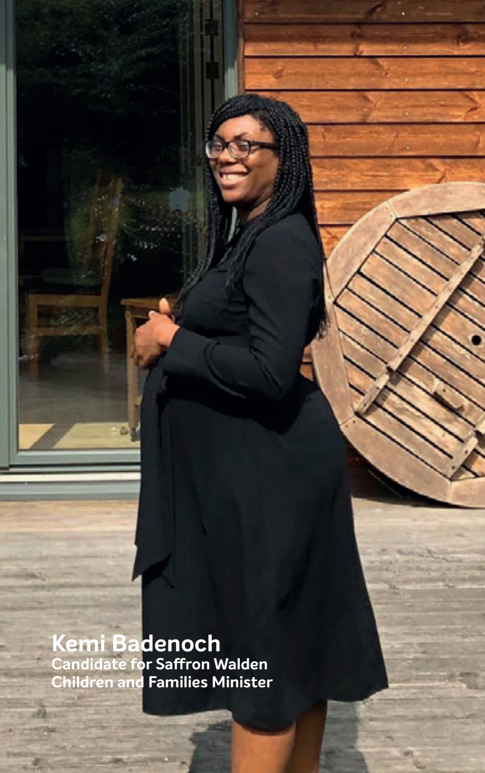
Kemi Badenoch Candidate for Saffron Walden Children and Families Minister

employment and high standards – between dynamic growth and protecting employees from unfair policies and discriminatory treatment. Over the last year, for example, unemployment has continued to fall, even as average real wages have increased.