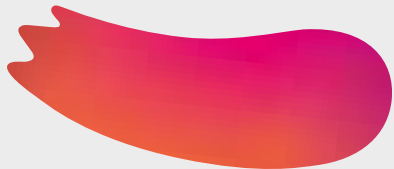
Annex 2: Average price paid by each cohort, relative to national averages