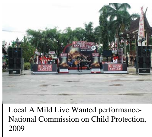
Local A Mild Live Wanted performance- National Commission on Child Protection, 2009