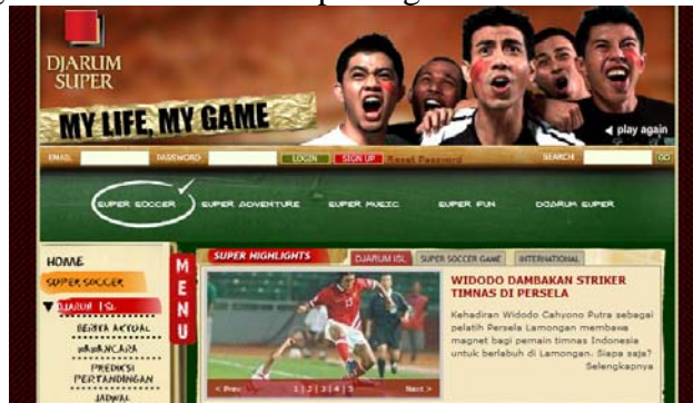
Screen shot from the Djarum Super website (July 6, 2009) http://www.djarum-super.com/index.php?vpage=1_6