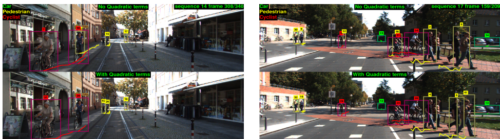
Figure 1: Our tracking framework incorporates quadratic interactions between objects in order to resolve appearance ambiguity and to boost weak detections. The parameters of the interactions are learned from training examples, allow the tracker to successfully learn mutual exclusion between cyclist and pedestrian, and boost to intra-class co-occurrence of nearby people.

there are a large number of parameters associated with these richer models which become increasingly difficult to set by hand and necessitate the application of machine learning techniques.