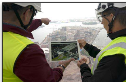
Helsinki's city digital twin is accessible across the city via desktop and mobile devices

Then, in 2016, they continued their mission to become a model digital city by producing a 3D representation of the city to improve Helsinki's internal services and processes, promote smart city development, and share city models as open data to citizens and companies for research and development. The use of reality modeling software significantly lowered the cost of making the reality mesh model of the city and the semantic city information model. The interoperable modeling applications provided the City of Helsinki with the ability to implement smart city development, advanced city analyses, and the opportunity to participate in frontline progress.