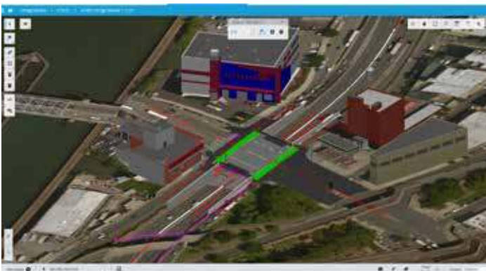
Using iTwin Design Review provided an integrated digital environment for more than 180 reviewers across 15 agencies to optimize design review and change management.

familiar with Bentley applications, NYSDOT selected OpenBridge Modeler, ProSteel, and MicroStation to develop a 3D model of the entire bridge structure to a level of detail that contractually enabled the team to build directly from the model, without requiring the aid of a complete set of 2D plans. The interoperability of Bentley's modeling software enabled NYSDOT to directly reference the highway designers' OpenRoads alignment file in the 3D bridge model, ensuring positional accuracy. Integrating iTwin Design Review to the project allowed more than 180 reviewers across 15 agencies to easily access and comment on the model in a digital environment.