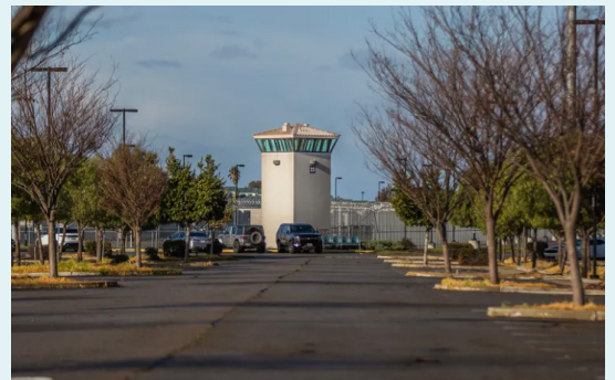
CA Health Care Facility in Stockton