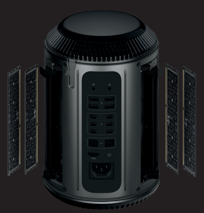
Hook it up.

You've got four channels of blazing-fast memory. And upgrading it is just as fast.