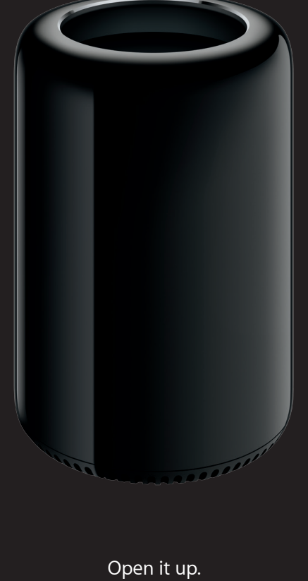
Just slide the enclosure release to the right and lift.