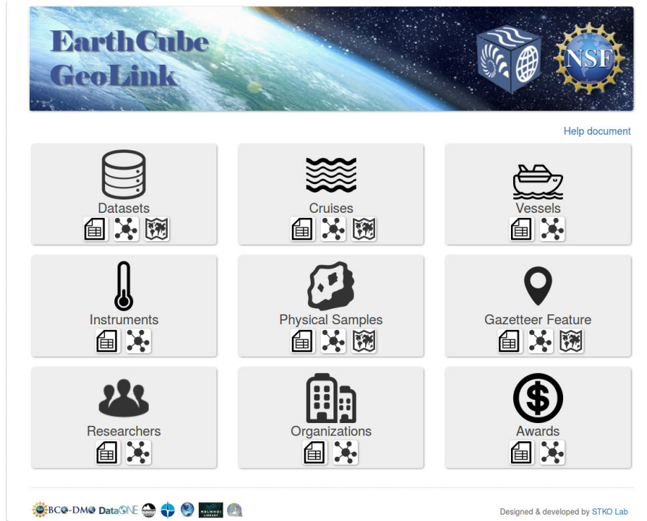
Fig. 1 The initial view of the GeoLink interface.

ence domains. However, FedViz can only support users to ask relatively simple questions which can be formalized as one federated/non-federated SPARQL query. Complex queries which require a combination of results of several different queries, like a path query over two given end nodes are not supported.