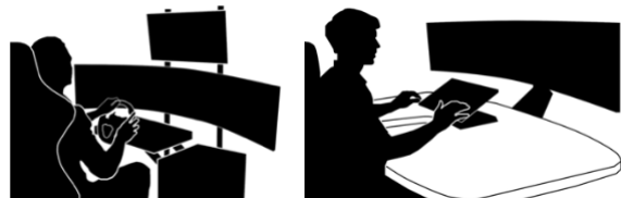
Figure 1: Left image – a schematic drawing of tele-driving, Right image - a schematic drawing of tele-assistance.

Since teleoperation of AVs is an emerging area of research, currently there is no uniform teleoperation terminology across industry and academia [4]. However, it is possible to divide teleoperation into two major paradigms: tele-driving and tele-assistance (Figure 1). In tele-driving the remote operator uses a steering wheel and pedals (or other controls such as a joystick) to continuously drive the AV, while in tele-assistance the lower-level maneuvers are delegated to the AV through high-level instructions by the RO [13].