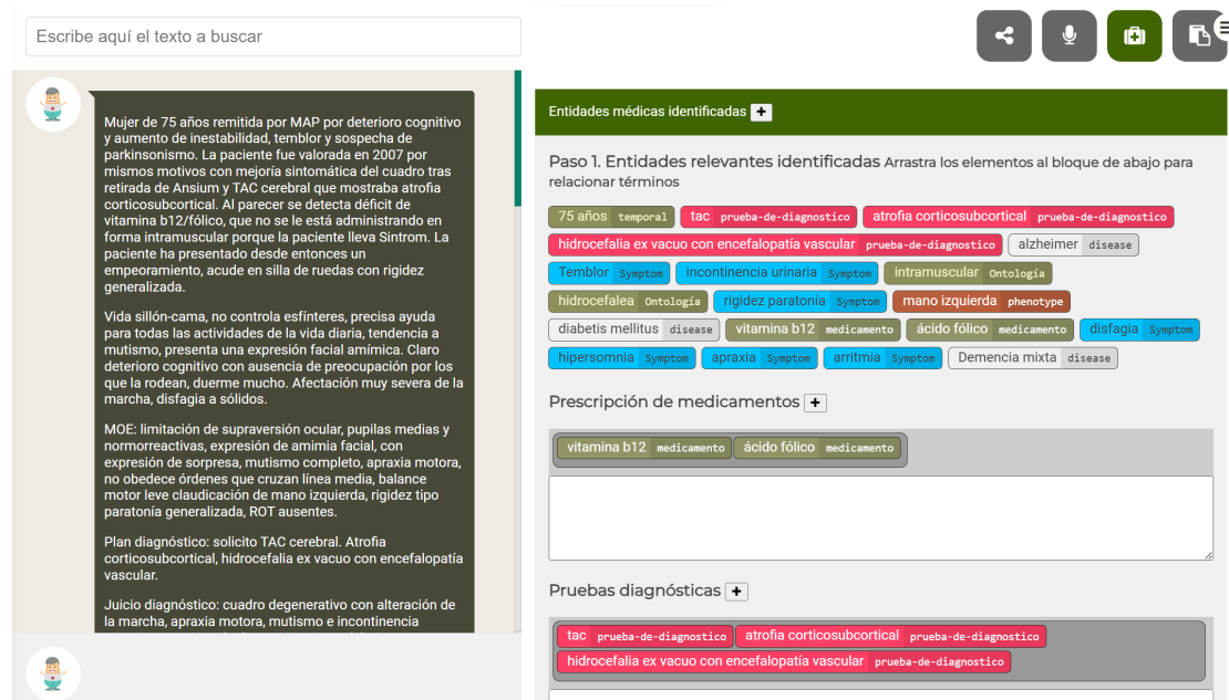
Figure 2: Web application

by the professional by adding SNOMED CT [17] codes so that the concept being treated can be easily identified.