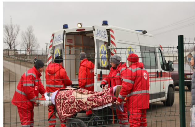
Entry-exit checkpoint in Stanytsia Luhanska, Luhansk Region

uncontrolled areas much more convenient for the 13,000 people who cross the contact line via this EECP daily. The damaged part of the bridge that had been fixed with a makeshift wooden structure which people had to climb down and up, often carrying a load, is now repaired and suitable even for cars and smaller trucks. The EECP infrastructure has been upgraded, with new service windows opened: on the day of the mission’s visit, some 20 service windows operated on each side to let people through from the controlled to the uncontrolled territory and the other way around. The road leading from the EECP to the repaired part of the bridge has been paved. During the EECP opening hours, a bus and two UNHCR-provided electric cars carry persons with limited mobility over the approx. 800 meters from the Ukrainian EECP to the bridge. People who were crossing the contact line at the time of monitoring mission’s visit unanimously appreciated the improvements, and one woman from the uncontrolled territories even thanked the mission members for these more humane conditions.