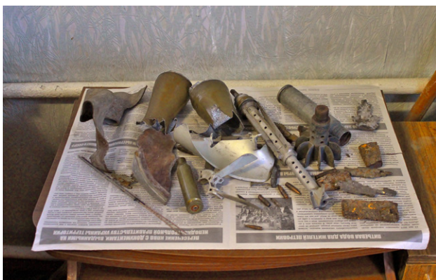
At the Civil-military administration in Krymske, Luhansk Region

Residents of Marinka, Krymske and Trokhizbenka said about rare shelling, but in Pisky people report about