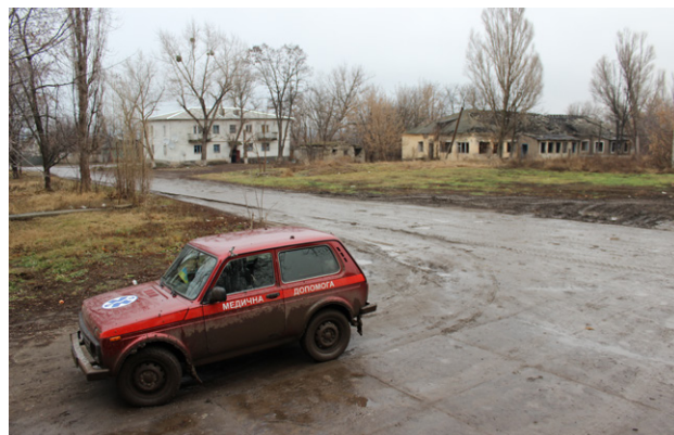
Krymske settlement, Luhansk Region

Despite poor road conditions in both settlements operate well stocked shops. According to shops assistants, supplies arrive once per week and only in case of extreme weather conditions they are postponed. Pensions are delivered either by post or mobile units of Oschadbank. In comparison with Donetsk Region, the road conditions in Luhansk are noticeably worse.