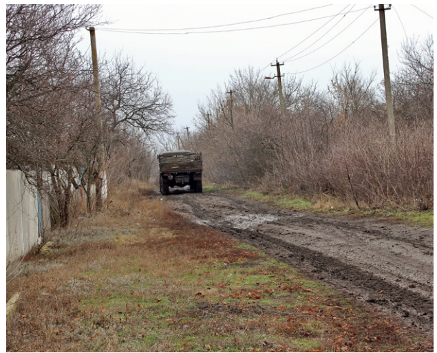
Street in Bohdanivka at the disengagement area No. 3, Donetsk Region

The other disengagement area in Luhansk region includes most of the village of Katerynivka (86 houses with 150 residents, including 7 children) which had been in the “gray zone”, i.e. not controlled by either side, until end-2017. This village is located in close proximity to the town of Zolote and the EECF of the same name, which was opened by the Ukrainian side in 2016 but still cannot be used for crossing the contact line because it is blocked by the self-proclaimed “LPR.” This disengagement area also includes a road leading from the EECF in Zolote to one of the town’s districts, namely the “Rodina” coalmine settlement (Zolote-4).