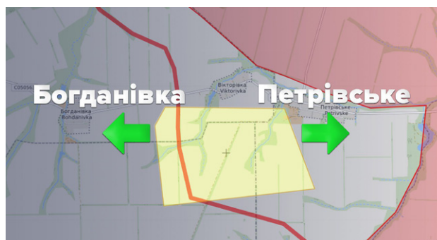
Disengagement area at Bogdanivka and Petrivske, Donetsk Region

Thus, by early November 2019, armed forces and weapons had been withdrawn by both sides and partial demining conducted in three pilot zones which had been determined in 2016 by the Trilateral Contact Group in Minsk. In the government-controlled territory, these include the areas located at Stanytsia Luhanska and Katerynivka, the latter bordering on the town of Zolote, in Luhansk region, and the area between Bohdanivka, government-controlled, and Petrivske, under the control of the so-called “DPR”, in Donetsk region.