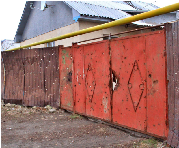
Street in Stanytsia Luhanska, Luhansk Region