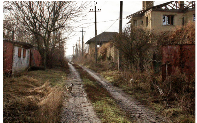
Street at Pisky settlement, Donetsk Region

government has not demonstrated sufficient willingness and ability to take effective steps towards meeting the basic needs of local residents. Still unresolved are problems with restrictions of the freedom of movement, with certain aspects of ensuring security, with critical road condition and absence of regular transport service, with unemployment and extremely low living standards as a result, with limited access to administrative services, pensions and social benefits, with shortages of hygiene products, drinking water, food, and fuel for heating homes, and with interruptions in electricity, gas and water supply. Given that the Ukrainian authorities were unable to address these problems during the five and a half years while these territories were fully controlled by the Ukrainian army and police, declarations by government officials that these problems will be effectively resolved once the disengagement partially removes them from Ukraine's control sound extremely unconvincing.