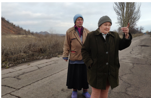
Women from Marinka, Donetsk Region

The town of Marinka is located next to Donetsk. Some of its streets lead directly into the city. In the beginning of 2015 Marinka turned out to be in the “gray zone”. In June, part of the town was seized by the armed forces of the so-called “DPR”, but eventually it was recaptured by the Ukrainians. Today life is slowly coming back to the town, especially to its central part. Several streets located close to the contact line are still directly affected by shelling. Out of 10,000 residents before the war there are roughly 4,000 left. EECP is located on the outskirts of Marinka.