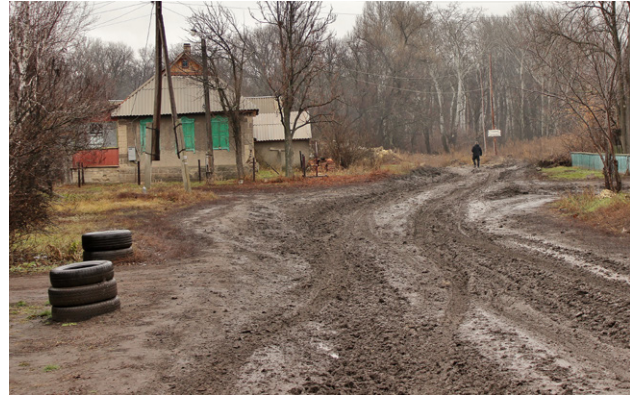
Road from Krymske to the floating brigde © Marta Szczepanik