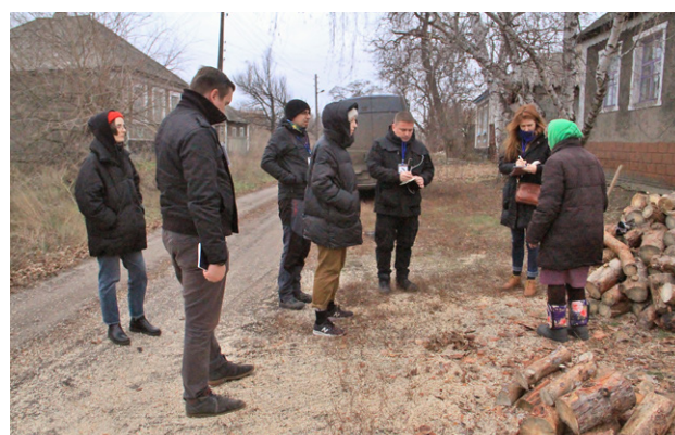
Mission members talk to a woman in Lopaskyne, Luhansk Region

The findings from our field observations confirm those fears. Based on conversations with representatives of local authorities of settlements adjacent to the contact line, they do not know about any official plans or instructions for providing civilians with security after the disengagement of the Ukrainian armed forces. According to the above-cited agreement about the disengagement, any armed groups are not allowed to enter into the two-kilometer demilitarized zone. Those areas are to be patrolled by the Ukrainian police. It is highly questionable whether unarmed police officers will be able to maintain public order. For example, in Trokhizbenka, there will be only 20 policemen to patrol the entire area of around 52 kilometers connecting Triokhizbenka to nearby villages of Orekhovo-Donetske and Kriakivka, on the one side,