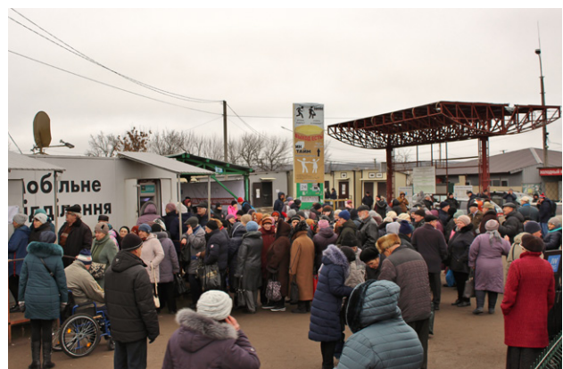
Entry-exit checkpoint in Stanytsia Luhanska, Luhansk Region

Entrepreneurs who transport small (up to 75 kilograms) loads of food and household goods from Stanytsia Luhanska to the uncontrolled territory also praised both the more comfortable border crossing and a simplified procedure for goods transportation. They noted that