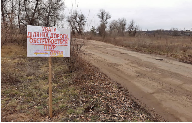
Road between Kriakivka and Trokhizbenka, Luhansk Region