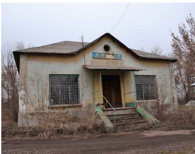
Closed shop in Katerynivka, Luhansk Region

As mentioned above, the village of Katerynivka that borders on Zolote and stretches over nine kilometers, used to be in the "gray zone" from the summer of 2014 to the end of 2017. Over this period, humanitarian organizations were the only ones helping some 300 (of the pre-war 500) local residents, mainly retired elderly persons (60%) and those who lost their jobs when the conflict started. The government's involvement partly resumed after the village was taken under full UAF control in early 2018 and the MCA of Zolote and Katerynivka, which was established in 2014 but inactive for more than three years, finally began its work. Between 2018 and 2019, a medical station resumed operation in Katerynivka. Today, an ambulance can be called from Zolote-3 (Stakhanovets) and the Ukrainian post delivers pensions to the elderly. However, the roads connecting Katerynivka to the district and regional centers remain in critical condition. As before, there is no direct passenger service between Katerynivka and other settlements.