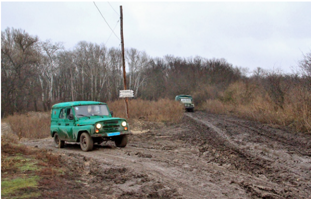
Road from Krymske to the floating brigde