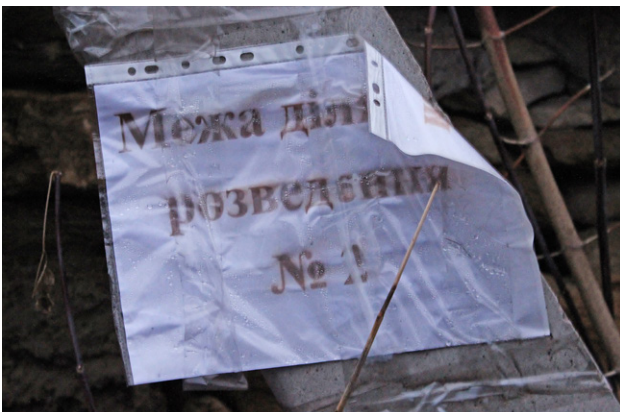
How citizens are being informed. Disengagement area No. 2 in Katerynivka, Luhansk Region

The other disengagement area in Luhansk region includes most of the village of Katerynivka (86 houses with 150 residents, including 7 children) which had been in the “gray zone”, i.e. not controlled by either side, until end-2017. This village is located in close proximity to the town of Zolote and the EECF of the same name, which was opened by the Ukrainian side in 2016 but still cannot be used for crossing the contact line because it is blocked by the self-proclaimed “LPR.” This disengagement area also includes a road leading from the EECF in Zolote to one of the town’s districts, namely the “Rodina” coalmine settlement (Zolote-4).