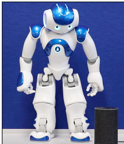
Figure 1. The Walkie-Talkie double act of NAO and Alexa.