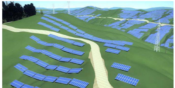
POWERCHINA Hubei’s custom software kept panel shading below 2%, which maximizes daily electrical production.

The power station is now operational and delivering renewable energy to Hubei. POWERCHINA Hubei subsequently worked with Bentley experts to establish the China Power Engineering Software Research and Development Center, which expands upon the techniques used in the Guangshui project and enhances the organization’s ability to offer integrated digital solutions across the lifecycles of future solar power stations.