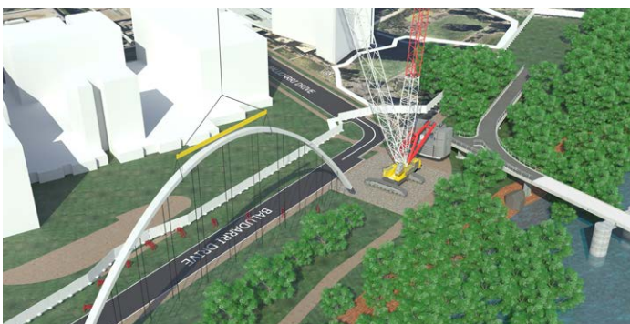
Alfred Street Bridge is an iconic diagonal arch pedestrian bridge supporting eco-friendly city accessibility in Parramatta, New South Wales, Australia.