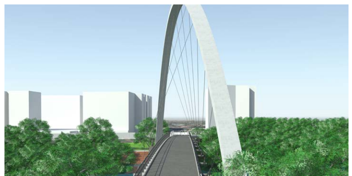
SYNCHRO enabled Solid Support to save 50% in time by generating an accurate digital representation of the bridge installation for their client.