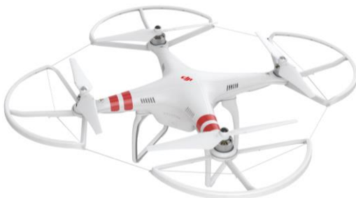
Fig.3 Complete/图 3 正确安装示意图