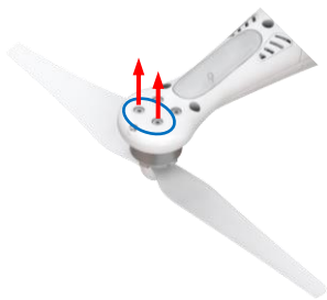
Fig.1 Removing Screws/图 1 卸下原螺丝

注意: 此处安装桨保护器, 使用型号为 M3x12 的螺丝; 如果没有安装桨保护器, 只能使用型号为 M3x8 螺丝。否则, 过长的螺丝会损坏电机。