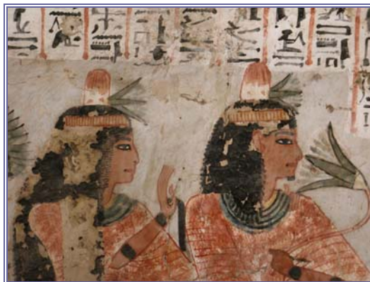
Figure 10. Couple with “unguent cones” and lotus flowers in TT 255 (19 th Dynasty).