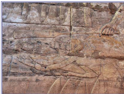
Figure 8. Pouring liquid scent over offerings in Luxor temple (18 th Dynasty).