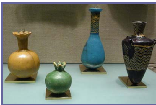
Figure 3. Glass perfume bottles in the Metropolitan Museum, New York (New Kingdom).

made astringent by adding herbs and spices. The recipes are meticulous in specifying quantities, especially of the reduction that would take place during cooking, which if done correctly, would have a pre-calculated end result (usually 1 hin , or 0.5 L).