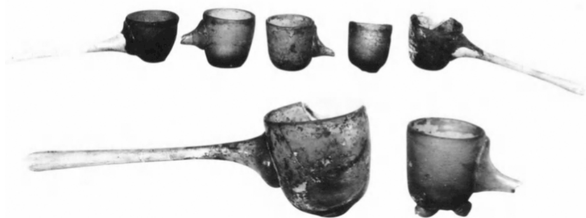
Fig. 6. Glass alembics. Tashkent Museum.

at 30 sites; the transformation of Samarkand into the capital of a great empire was accompanied by the expansion of glass production on a significant scale, and notably of window glass, as well as of glazed tiles and majolica ware. The Registan square in Samarkand was entirely occupied by craftsmen's workshops, and excavations here have brought to light the kilns and furnaces used by metal-workers, pharmacists, jewellers and ceramists, as well as crucibles, containing opaque coloured substances, which probably belonged to glass blowers or potters and were used to heat fritt, basic materials that served in the preparation of glazes and glass. Window glass is reported to have been found in the ruins of the 'Ishrat-Khana mausoleum and the Gur Amir complex in Samarkand, in monuments associated with Ulugh Beg in Bukhara, at Anau in Turkmenistan and in the ancient settlement of Shahr-i Sabz.