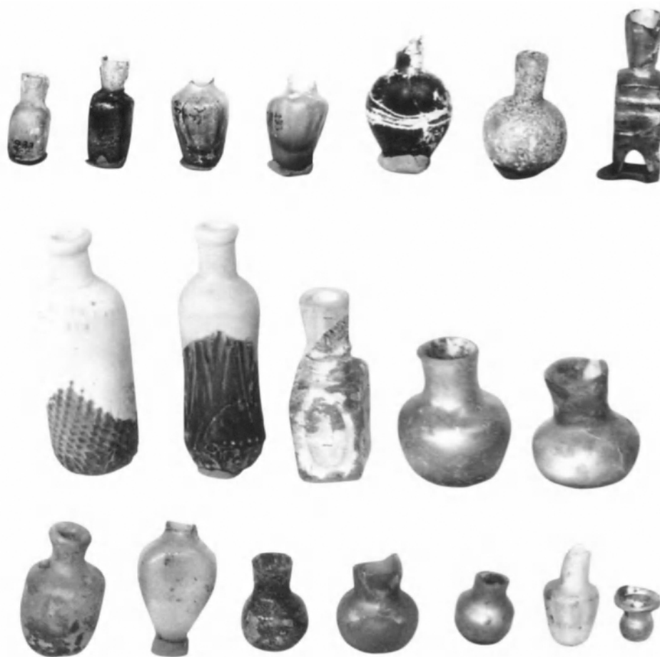
Fig. 2. Miniature flasks. Tashkent Museum.

everywhere (Fig. 2). Glass spoons or ladles have been unearthed at Kasan and Afrasiab (Fig. 3). Pieces of chemical apparatus resembling modern flasks and retorts have been found at Afrasiab, Akhsikath, Gumushkand, Old Termez, Hauz-Khan-kala, Gormali-tepe, Kal'-tepe, Bazar-dare, Tashkent and Kanak (Fig. 4). One particularly interesting item is a jar-like vessel in two parts which are separated by a thin piece of perforated glass (Fig. 5). Glass alembics dating from the ninth to the thirteenth century have been discovered in particularly large numbers at sites throughout Central Asia (Fig. 6), as have glass test-tubes (New Nasa, Merv, Kal'-tepe, Uzgend and Taraz), and weights of different sizes at Afrasiab. 15