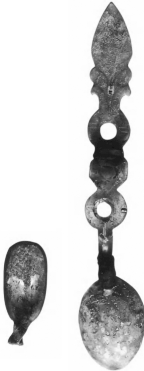
Fig. 3. Glass spoons. Tashkent Museum.

Healing) in Samarkand at this time attracted distinguished physicians such as Mīr Sayyid Sharīf, who came from Jurjan at Timur's invitation, and Mansūr b. Muhammad b. Ahmad, who wrote three medical works, one of which describes the properties of various simple and compound remedies. 16