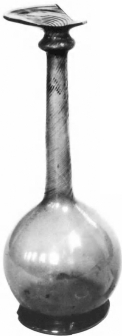
Fig. 4. Flask used for chemicals. Tashkent Museum.

interest in medicine and studied the works of various physicians, including Ibn Sīnā's Canon and Muhyī al-Dīn al-Juwaynī's Nigāristān [The Picture Gallery], which contains a section on medicine. Himself the author of a short treatise on medicine, Ulugh Beg protected scholars, ensuring that they enjoyed a good standard of living, and presided over the construction of hospitals and his famous observatory, so that during his reign, Samarkand became the meeting-place of a veritable pleiad of learned men. The later Timurid ruler Sultān Husayn Bayqara (d. 1506) and his vizier Mīr °Alīshīr Nawā'ī (d. 1501) also extended generous patronage to scholars, poets, philosophers and physicians. Among them was Hākīm °Abd al-Razzāq Kirmānī ( fl. late fifteenth-early sixteenth century), a versifier as