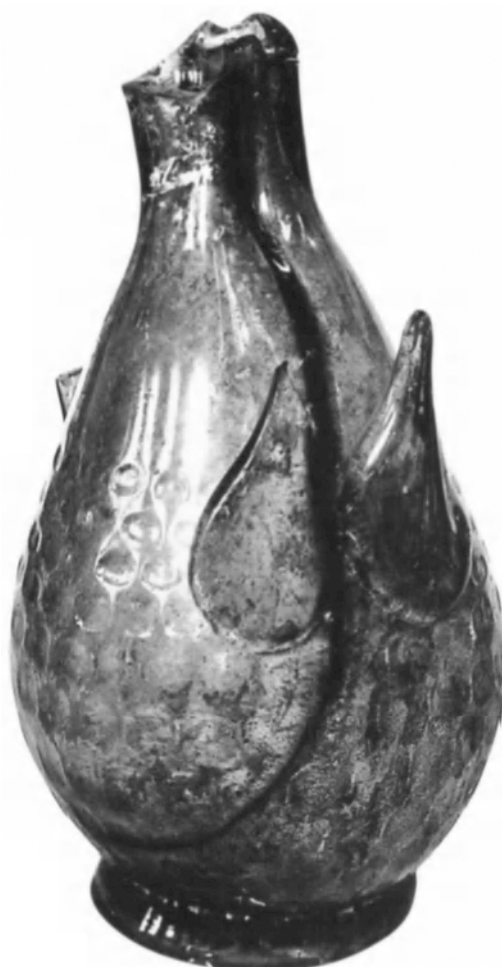
Fig. 5. Chemical jar-like vessel. Tashkent Museum.

well as the author of a work on medicine which contains accounts of different medicinal substances of vegetable and mineral origin, and of useful animals and birds, together with an appendix listing the names of medicines in the Arabic, Persian and Chaghatay Turkish languages. Mīr °Alīshīr Nawā'ī himself frequently returns to medical themes in his own writings. 17