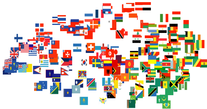
Figure 6. The flag images displayed according to their projection on the top two principal components of a PCA. The principal component is the horizontal axis.