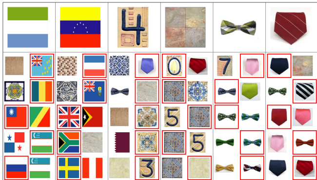
Figure 3. Six objects in the mixed dataset along with the adaptive pairs to which that object was compared, below, and user selections in red. The first pair below each large object was chosen adaptively based upon the results of ten random comparisons. Then, proceeding down, the pairs were chosen using the ten random comparisons plus the results of the earlier comparisons above.