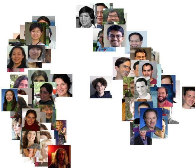
Figure 7. For fun: the faces of 186 colleagues displayed according to their projection on the top two principal components. The principal component is the horizontal axis.