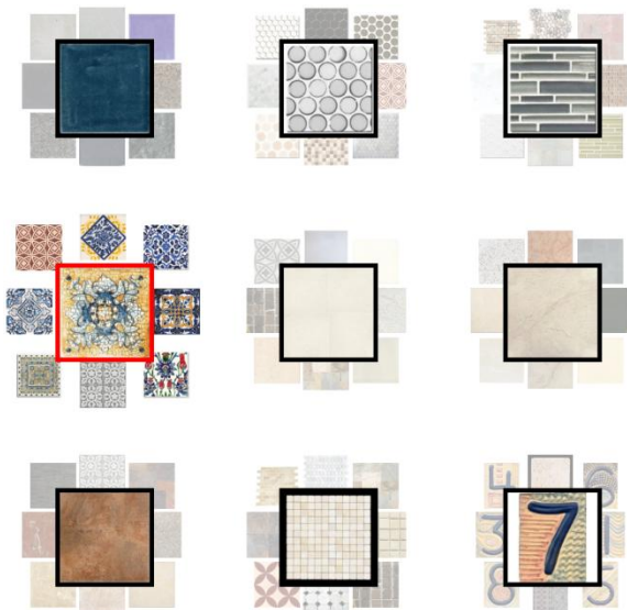
Figure 1. A sample top-level of a similarity search system that enables a user to search for objects by similarity. In this case, since the user clicked on the middle-left tile, she will “zoom-in” and be presented with similar tiles.

a more similar to b or to c ,” has a number of desirable properties over the classical approach employed in Multi-Dimensional Scaling (MDS), i.e., asking for a numerical estimate of “how similar is object a to b .” These advantages include reducing fatigue on human subjects and alleviating the need to reconcile individuals’ scales of similarity. The obvious drawback with the triplet based method, however, is the potential O(n^3) complexity. It is therefore expedient to seek methods of obtaining high quality approximations of K from as small a subset of human measurements as possible. Accordingly, the primary contribution of this paper is an efficient method for estimating K via an information theoretic adaptive sampling approach.