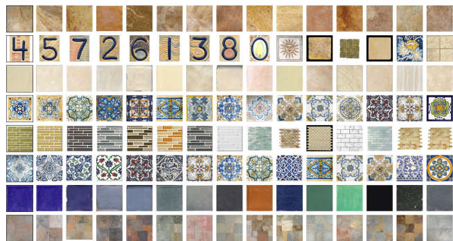
Figure 5. Examples of nearest neighbors for floor tiles.