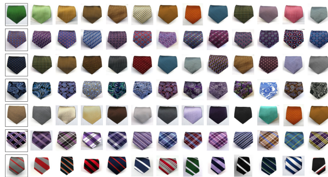
Figure 4. Nearest-neighbors for some neckties from the tie-store dataset. Nearest neighbors are displayed from left to right. Note that neck ties were never confused for bow ties, tie clips or scarves.