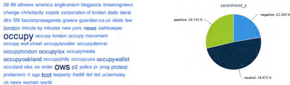
Figure 1 - Level 1 visualisation examples: a tag cloud and a pie chart

visual elements (pie chart sections or tags) can automatically add filters to the existing view, thereby triggering all the visualisations to be updated (R1.2). The high level overviews, in this level incorporate aggregate visualisations such as tag clouds, bar charts, pie charts (Figure 1, right). Most users are highly familiar and conversant with such visualisations and interaction paradigms and therefore, their application in analytic systems is essential, as it reduces the necessity for learning (R1.4). Our continued consultation with experts from emergency response teams ensured that the vocabularies and terminologies were compliant (R1.4) with such teams, and using basic HTML templates simplified the process of porting the visualisations to other teams (as we observed that individual teams have their own terminologies).