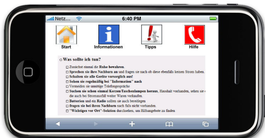
Figure 3: Screenshot of the prototype (in German)

In order to evaluate the concept it was implemented in Java as a clickable prototype, but without access to real time information (figure 3). The figure shows a screen with an advice how to behave in an emergency. The navigation furthermore shows the buttons “home”, “information”, “advices”, and “help”.