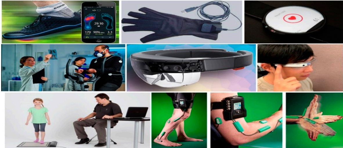
Fig. 2 Various Sensors used for data collection in IoT-smart healthcare [41-44].