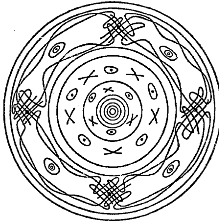
Fig. 3. Phase plane for one dimensional motion (with a time-dependent periodic Hamiltonian).