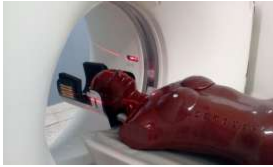
Figure 1. Female Rando Alderson phantom during positioning in the CT unit.

The phantom was digitized according to the clinical protocol defined for thoracic computed tomography that employs 16 MDCT scanners (GE Healthcare, BrightSpeed 16 Select). A preliminary assessment (scout) was carried out to check the positioning of materials and to delimitate the area to be irradiated.