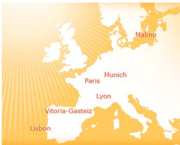
Figure 1. POLIS participating cities

Within the POLIS project, Work Package 3 deals with strategic measures of urban planning and local policies, with the aim of integrating solar energy at urban level in new and existing developments. Particularly, each of the 6 participating cities of POLIS project (see Figure 1, Lyon and Paris in France, Munich in Germany, Lisbon in Portugal, Malmö in Sweden and Vitoria-Gasteiz in Spain) have committed on long-term strategies to integrate solar energy at urban level that are consistent with existing CO 2 mitigation targets (related to national/regional requirements or voluntary commitments, for example, the Covenant of Mayors, signed by all POLIS participating cities) in solar Action Plans embeded in local planning.