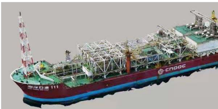
CNOOC relied on Bentley’s open 3D and reality modeling applications to generate a 3D reality mesh and digital twin of an FPSO oil platform in the South China Sea.

Bentley’s collaborative digital solution provided a breakthrough integrating multiple core data sources, including 325 videos, 7,498 images, and 844 point clouds to generate an accurate 3D reality mesh. “[Bentley’s] reality modeling software can effectively organize different types of source data for the establishment of reality models,” said Shi. Integrating OpenPlant for 3D structural modeling, they superimposed the engineering model with the reality model to determine risk areas and operation and maintenance conditions, ensuring facility safety.