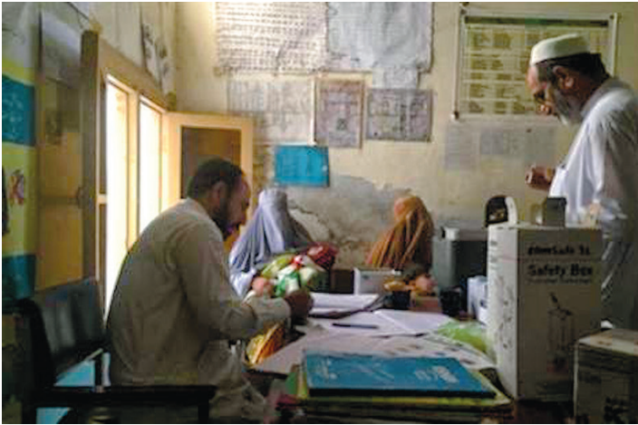
Photo: EPI workers vaccinating children at a vaccination centre in Peshawar, Pakistan (Photo credit: Ayesha Naeem, used with permission).

The synergy between EPI and PEI, which is crucial for achieving and sustaining polio-free Pakistan, and improving routine immunization (RI) as well, requires unpacking the concept at the federal and provincial level, with its operationalization ensured at the district and field level (Figure 1). The shared vision of achieving a polio-free Pakistan through improved RI needs to be adopted at all levels. The adoption should be incorporated into strategic plans, along with monitoring and evaluation.