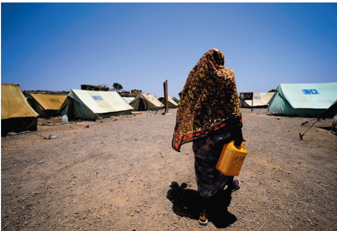
Photo: A woman carries a water container at Al Kharaz Refugee Camp, Yemen. Source: 2009-272. © 2009 Micah Albert, courtesy of Photoshare.

The platform's limitations are related to the inability to vary all underlying inputs and data gaps around humanitarian-specific interventions as well as intervention effectiveness tested in these settings. Collection of health data during an emergency may be incomplete and routine monitoring and evaluation data collected in more stable, protracted situations may not directly align with assumptions or indicator definitions employed in the Lives Saved Tool. Many H-LiST options were streamlined to avert incompatibility issues. For example, selection for coverage scale-up was restricted to one pattern of change for each intervention category.