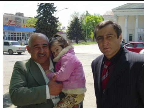
Contemporary Adyghe Men, with granddaughter