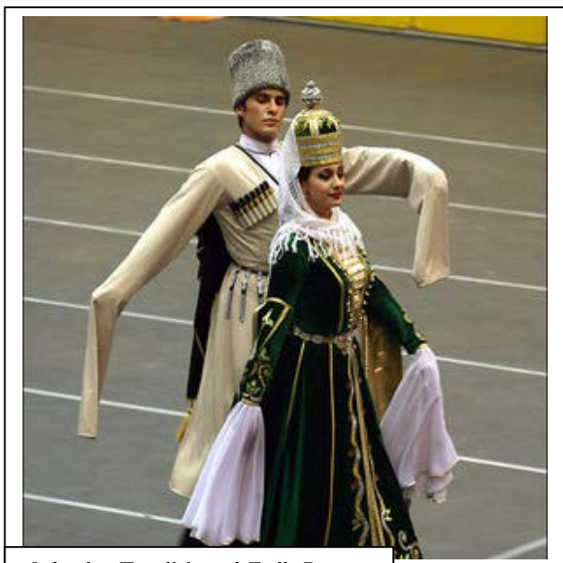
Adyghe Traditional Folk Dance

Present estimates are approximately 140,000 Adyghe in southern Russia, with at least 10 times that many in diaspora locations, especially in Turkey and the Middle East. In Adyghe history, most Adyghe were nominal Christians from the 10 th to the 17 th Centuries. In the past two decades there is a resurgence in Adyghe self-awareness and ethnic identity. Pray that the Bible in authentic Adyghe will make more and more inroads into Adyghe culture and connect with ancient oral traditions.