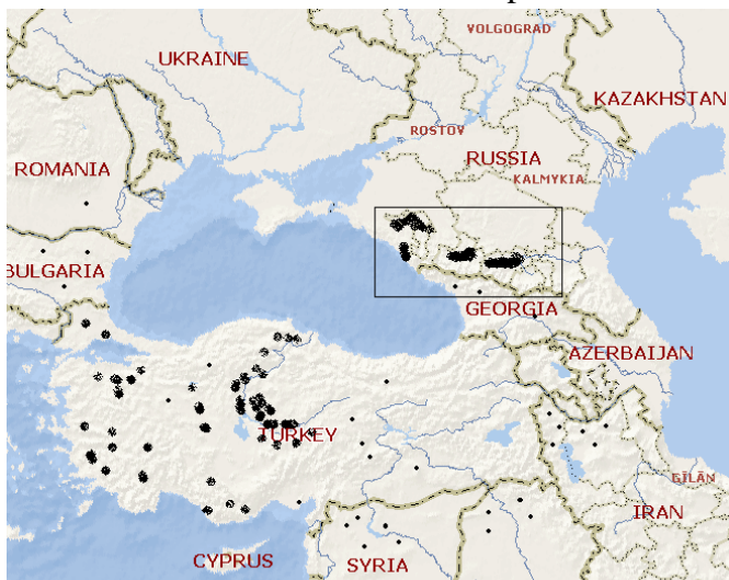
MAP showing present locations of Circassians [dark-shaded regions] in southern Russia, Turkey, and the Middle East. -- Note the outlined rectangular region in southern Russia—the Adyghe are located in the two black areas at the west end; the Kabardians in the two black areas in the center.

Ninety eight percent of all Adyghes claim to be Sunni Muslim. There are approximately 100 Adyghe Christians in the world and there is one indigenous church of about 40 members located in southern Russia. The rest are dispersed among Russian Orthodox and Evangelical churches. The entire New Testament and 12 books so far in the Old Testament have been translated into the Adyghe language. Adyghes in southern Russia also have access to the Central Asian Russian Scriptures (CARS) which uses language familiar to Muslims.