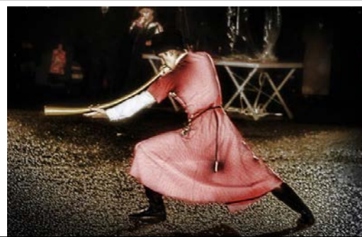
Traditional Adyghe Warrior with Trumpet

* PRAY for men and women of peace (Lk 10:6) in each Adyghe town/village, to be keys to welcoming the love of God, the grace of Jesus, and the power of the Holy Spirit into each community in the years ahead. II Cor.13:14