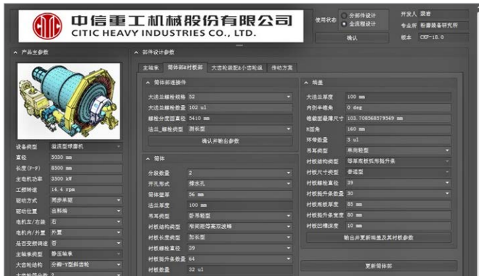
Using Bentley applications, Citic created a digital construction management system, reducing construction time by 7%.

integrate process data related to equipment operations. This process facilitated online, intelligent equipment monitoring and diagnostic services, establishing a preventive maintenance system that enhanced operational safety and improved equipment reliability. Through Bentley’s integrated, cloud-based applications, Citic produced accurate 3D models of the entire main equipment and can now digitally monitor plant equipment and processes, achieving whole lifecycle BIM management from design through delivery and operations.