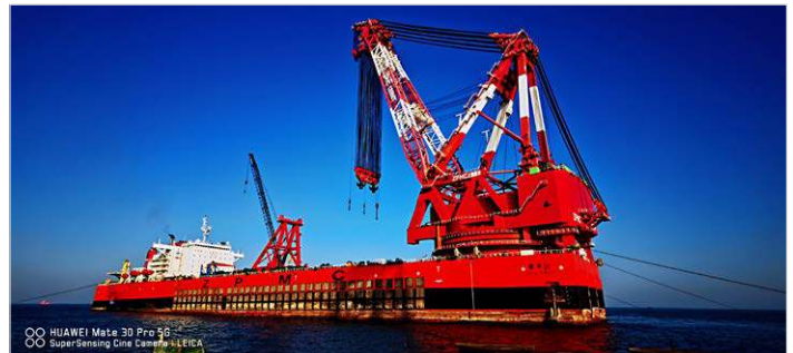
The wind farm eliminates the use of 535,000 tons of coal annually and cuts down on carbon dioxide emissions from various power generation sources by 1,462,600 tons.

By determining the feasibility of the three-pile suction conduit frame foundations, Fujian Yongfu ensured the wind turbines can withstand typhoons, shifting soil, and earthquakes. Compared to more traditional offshore wind turbine designs, the solution reduces costs by 30%, or more than CNY 400 million. Establishing 496 megawatts of clean energy in Fujian will eliminate the need to burn 535,000 tons of coal annually and cut down on carbon dioxide emissions from various power generation sources by 1,462,600 tons. The design also helped Fujian Yongfu minimize environmental impact by sustaining water quality, minimizing erosion, and protecting marine and avian life.