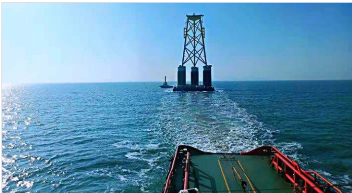
Fujian Yongfu Power Engineering needed to build a large wind farm in an area prone to typhoons, earthquakes, and shifting soil.

They first used PLAXIS to perform a full analysis of the soil in the construction area that could also measure the potential effects of design options. Within that environment, they then simultaneously formed and optimized the design of the foundation in OpenWindPower Fixed Foundation while examining how the current state of the design would interact with the soil. The design team used a suction pile module within SACS to automatically import PLAXIS analysis and create a composite model, which shows both the current state of the model and its effects on the soil around it. With this information, they adjusted the model to increase its strength and stability.