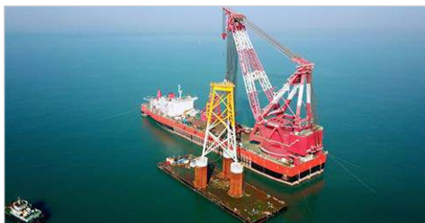
Compared to more traditional offshore wind turbine designs, the solution reduces costs by 30%, or more than CNY 400 million.

The design team soon discovered that they also could not rely on traditional methods of offshore wind design. Their initial attempt with these methods could not accurately simulate the interaction between the soil and a pile with such a large diameter, producing an overly conservative design that would have significantly increased the cost of the project. Fujian Yongfu then tried to use separate digital simulations of the interaction between the pile and the soil and the design of the frame itself, but they learned that the two separate results were difficult to unify. They needed digital design software that could unify soil analysis and digital foundation design to determine how to effectively use the suction pile method for wind turbines.