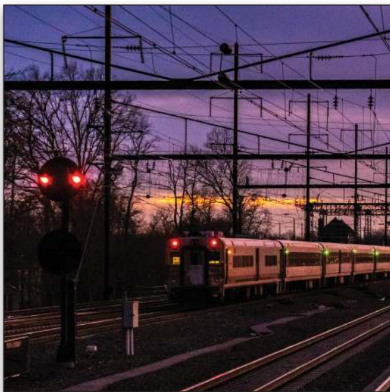
Save time and reduce tedious manual work. Automate the production of a complete array of design deliverables.

OpenRail Overhead Line Designer provides a comprehensive modeling environment for the project delivery of rail and road networks, unifying design and construction. Users can easily integrate data from different disciplines to improve collaboration and ensure the latest model is used in all phases of the design.