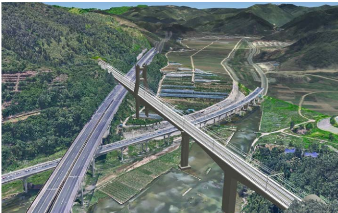
Bentley applications streamlined contributions from all disciplines, improving collaboration efficiency by 50%.