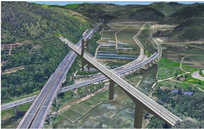
Bentley applications streamlined contributions from all disciplines, improving collaboration efficiency by 50%.