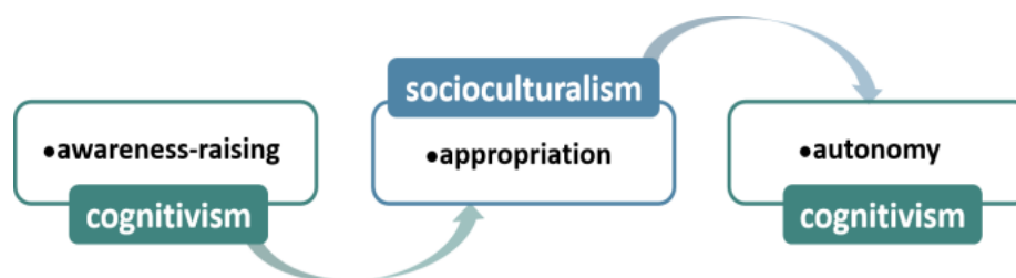
Figure 2: Theories Underlying 3As Approach

Thornbury's (2012) approach to teaching speaking is referred to as the 3As approach (initialism for awareness-raising, appropriation, and autonomy) in this study for ease of use.