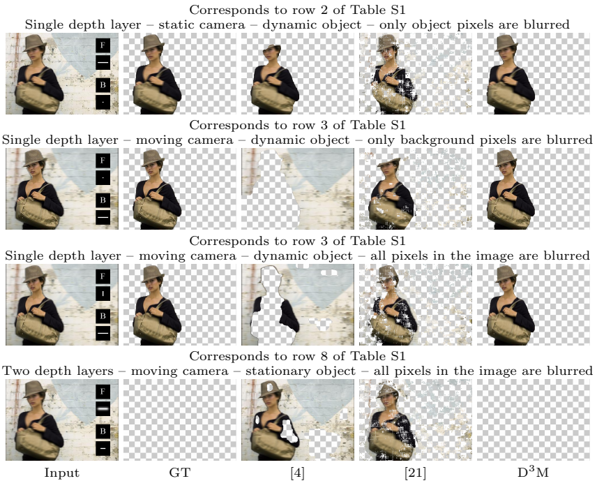
Fig. S1. A synthetic example demonstrating D 3 M’s ability to segment moving objects under various types of camera and object motions. The foreground and background kernels are overlaid on the input images. See the text for details.

and which are not. In fact, there are several methods ((i) Liu et al., “Image partial blur detection and classification,” in CVPR 2008, (ii) Su et al., “Blurred image region detection and classification”, in ACM international conference on Multimedia, 2011, (iii) Pang et al., “Classifying discriminative features for blur detection,” IEEE Transactions on Cybernetics, 2015, and (iv) Lee and Kim, “Blurred image region detection and segmentation,” in ICIP, 2014) that exclusively tackle the problem of detecting blurred pixels in natural images. However, none of these techniques address the issue of segmenting dynamic objects, and that is why these comparisons have been omitted. On the other hand, our proposed framework is end-to-end and can unambiguously detect moving objects at different depth layers directly from the input blurred observation.