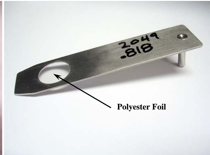
8069 Membrane Assembly