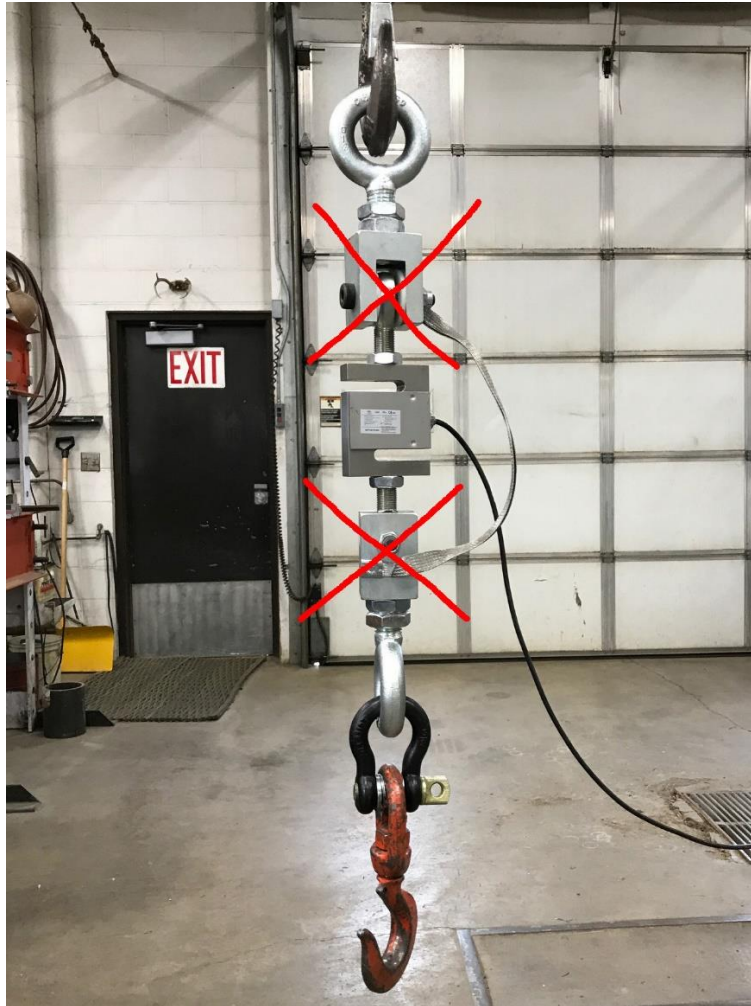
Two of the Six Adapters were Eliminated with the Morehouse Solution

Jeff worked with the Morehouse team to design custom adapters for a Morehouse shear web load cell, which reduced the number of adapters needed.