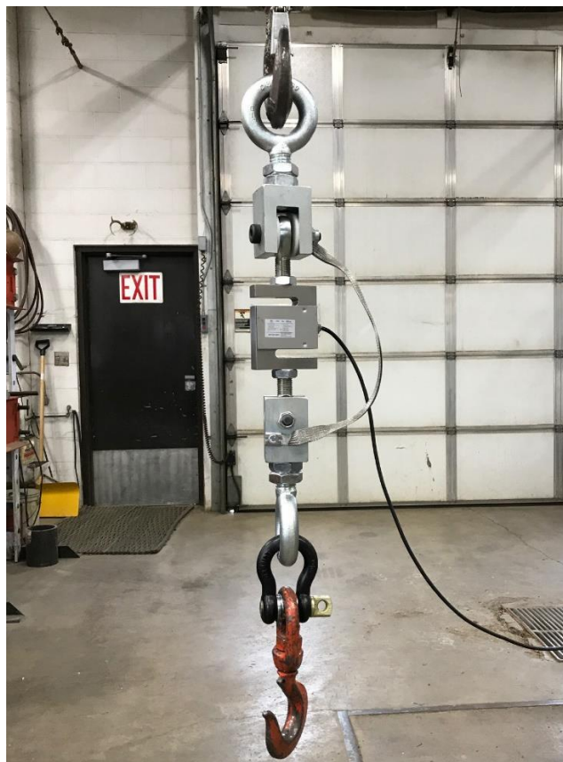
Crane Scale Setup with Six Adapters and S-beam Load Cell

Each adapter added to a load cell setup contributes to increased measurement error. The load cell's sensitivity to off-center loading will also increase measurement error. Together, these conditions created an undesirable crane scale setup at a state office of weights and measures.