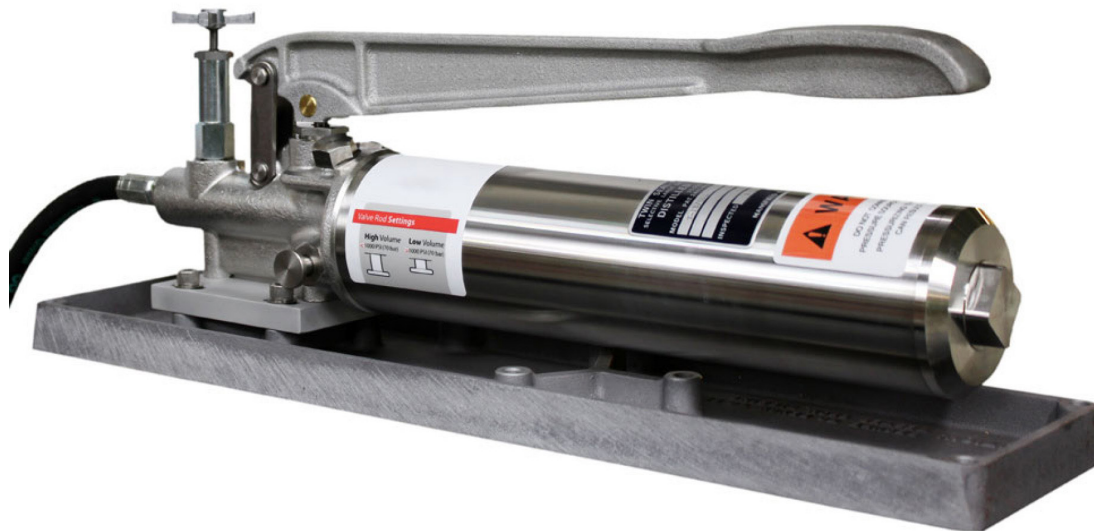
Figure 2: Hand Pump for Universal Scale Calibrator

The hydraulic jack is activated by a hand pump, which has a vernier screw piston. The pump is connected to the jack with a hydraulic hose that has a quick disconnect on one end.