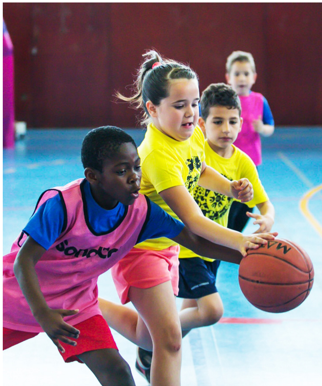
In Barcelona, city-wide initiatives such as sports activities for children facing social exclusion or economic hardship ensure that the Olympic social legacy lives on

The legacy objectives 2021-2024 were developed based on the progress made during the past three years, through a stakeholder consultation that included both internal and external stakeholders and has taken into consideration the contextual environment of a post-corona world.