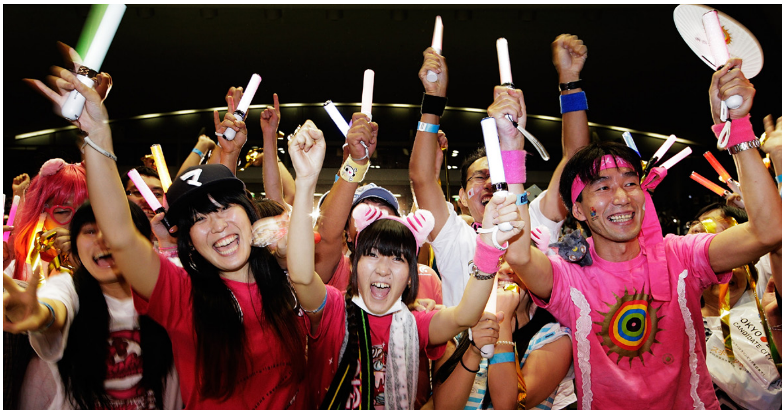
Tokyo 2020 presented a unique opportunity for the city to build on existing legacies of the Olympic Games Tokyo 1964, Sapporo 1972 and Nagano 1998