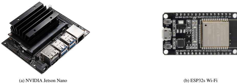
Fig. 1: Micro computer & Microcontroller

Our proposition is built around a micro computer and a Wireless Sensors Network which allows to acquire environmental data which are then processed at the edge level of the network.