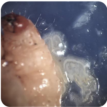
Figure 2. In vivo production of the beneficial nematode Steinernema carpocapsae using Galleria mellonella .

In vivo culturing methods: In vivo culturing, methods involve the use of a live insect host for production. The host used in in vivo culturing methods is typically the larvae of the wax moth, Galleria mellonella . The technology required for culturing is minimal; employing the use of trays and shelves for production (Brown et al. , 2006). A highly referenced method of in vivo culturing is based on the 'White Trap' technique which takes advantage of the progeny IJ's natural migration away from the host-cadaver upon emergence (Wouts, 1981).