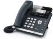
Yealink T4 series