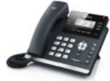
Yealink T4 series