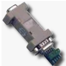
RBH-H485-232 RS232/485 Adaptor