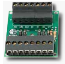
RBH-EXITRDR Exit Reader Module