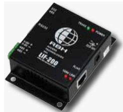
RBH-LIF-200 LAN Adaptor