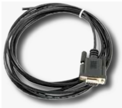
RBH-RS232-C (M) Serial Cable