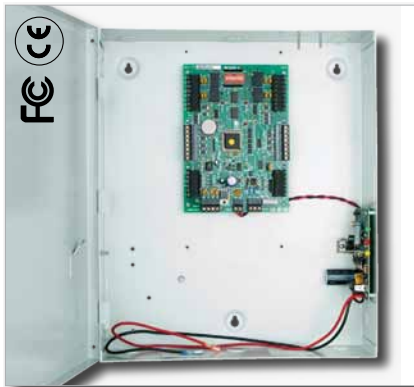
IRC-2000 Includes controller, ENCL1 enclosure and PS1224 power supply.