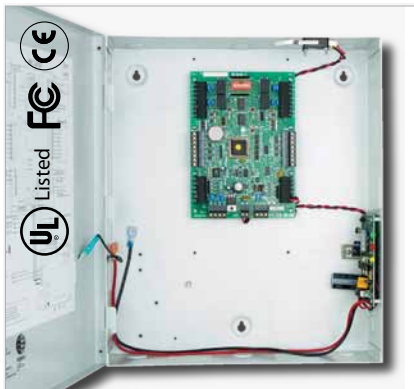
IRC-2000-UL Includes controller, ENCL1 enclosure, temper switch and PS1224 power supply.