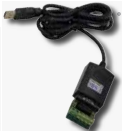
RBH-H485-USB USB/RS485 Adaptor