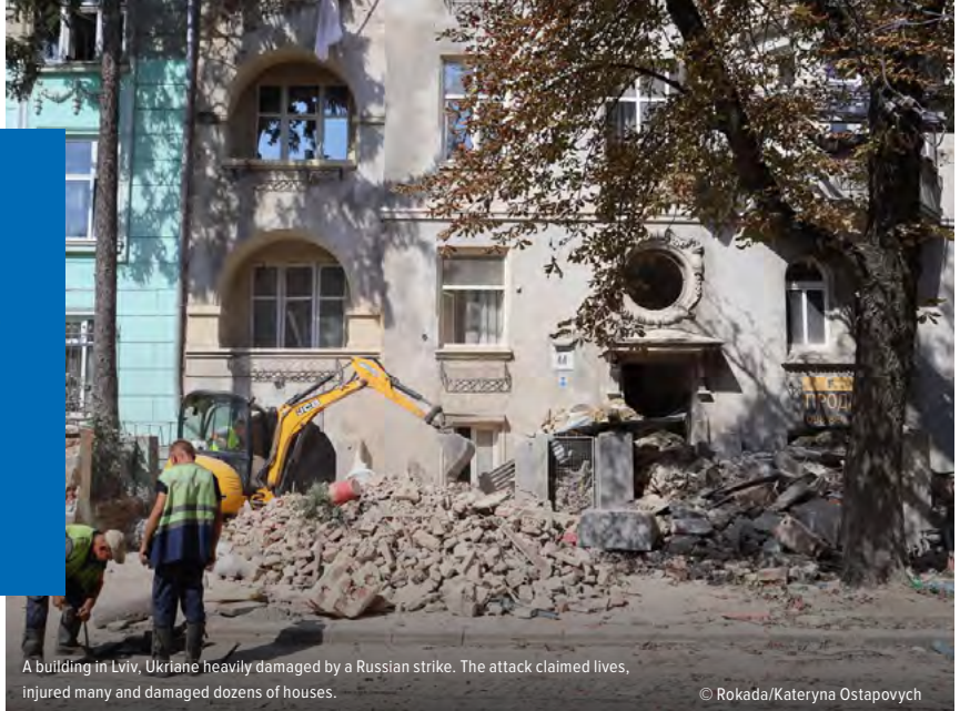
A building in Lviv, Ukraine heavily damaged by a Russian strike. The attack claimed lives, injured many and damaged dozens of houses.